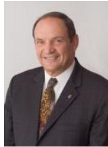
Steve Cook Governor 2012-13 District 7610